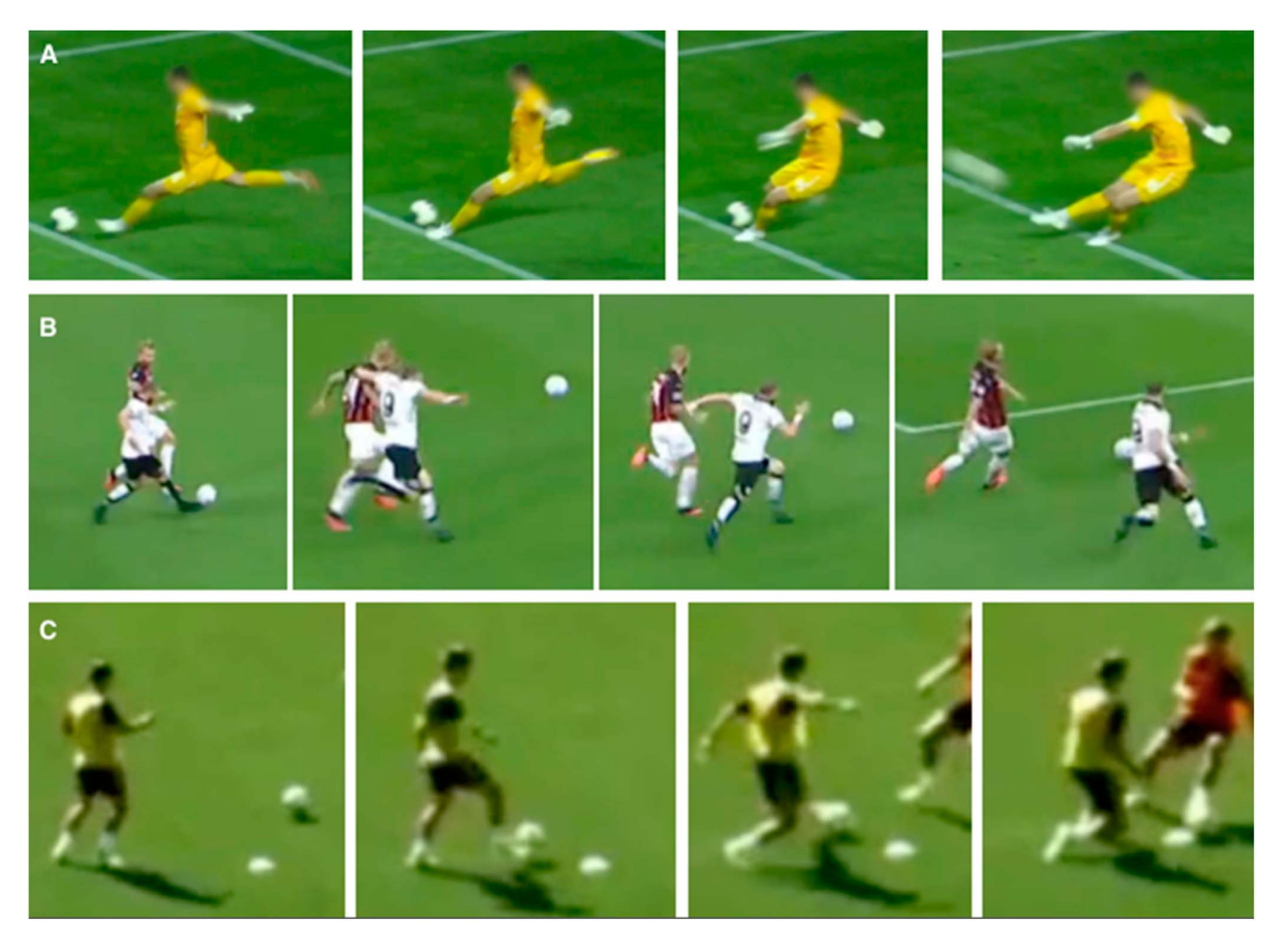
Figure 1. A: kicking, B: sprinting, C: change of direction.