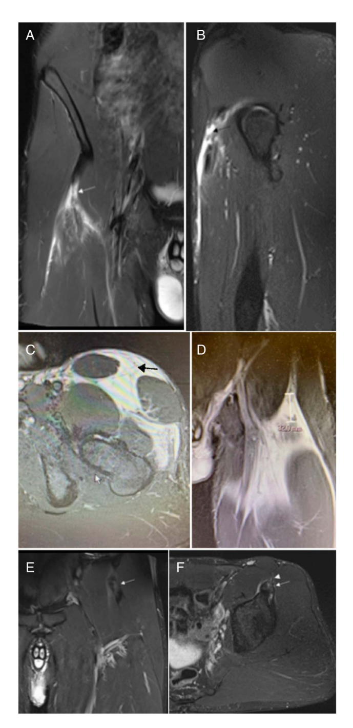
Figure 2. A: Coronal fat saturated proton density image that shows a complete rupture of the right RF common tendon. There is a gap of connective tissue (arrow), slight lost of tendinous tension, and loss of pennation angle. B: Sagittal fat saturated proton density image that shows the complete rupture of the common tendon (arrow). C: Axial fat saturated proton density image that shows the absence of left RF due to a complete rupture of the proximal tendinous complex (arrow). D: Coronal fat saturated proton density image where there is a distal retraction of the left RF of 3 cm. E and F: Coronal (E) and axial (F) fat saturated proton density images that show a hypertrophic and heterogeneous callus of the left RF direct tendon (arrow). The membrane that communicates the common tendon with the anterosuperior iliac spine is also thick with scar changes (arrowhead).

A. Jokela et al. (2023) Clin J Sport Med